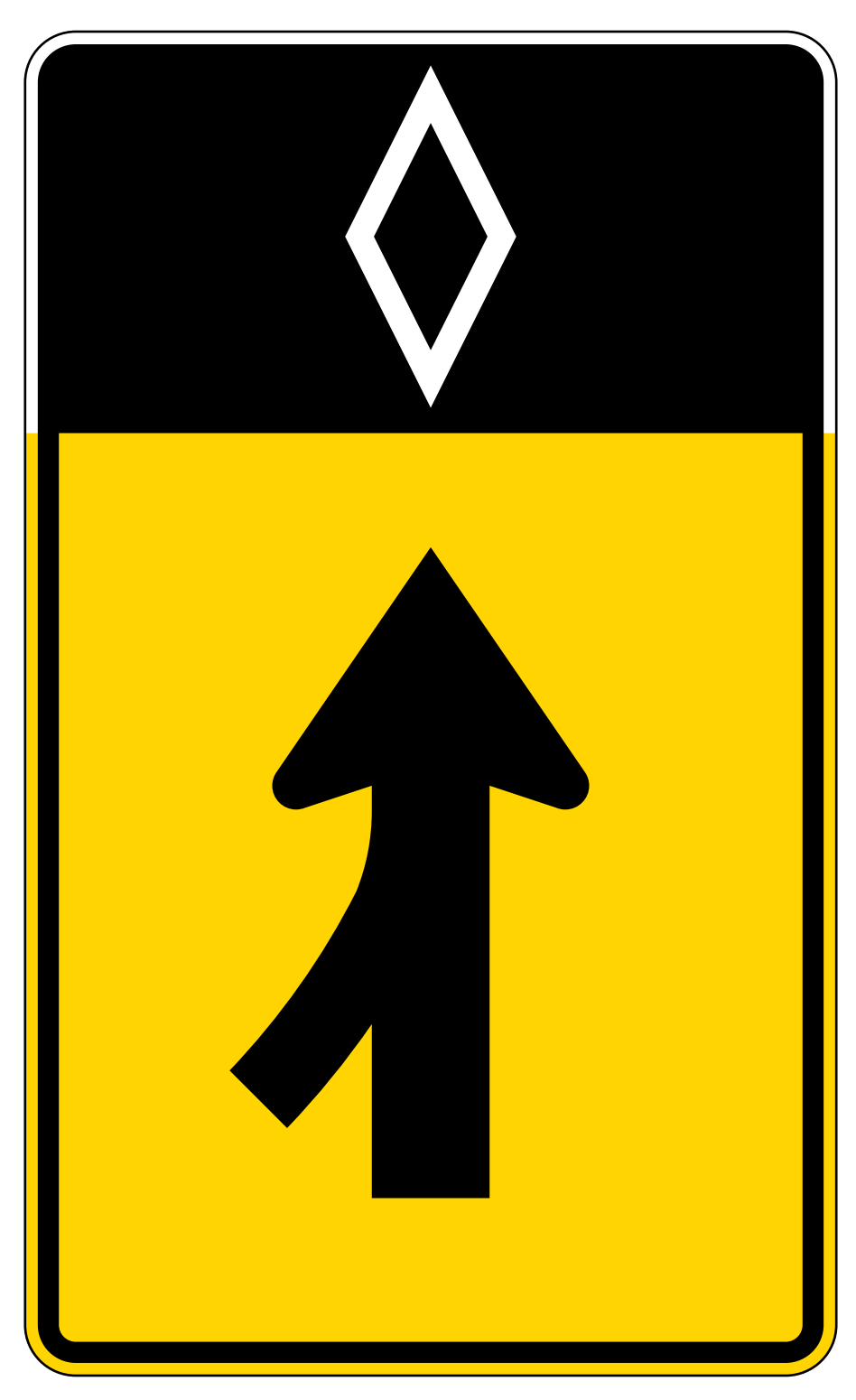
W4-1L (Modified) Merge (Modified For Preferential Lane Barrier) (Left)

Sign image from the Manual of Traffic Signs <a href="http://www.trafficsign.us/">http://www.trafficsign.us/</a>