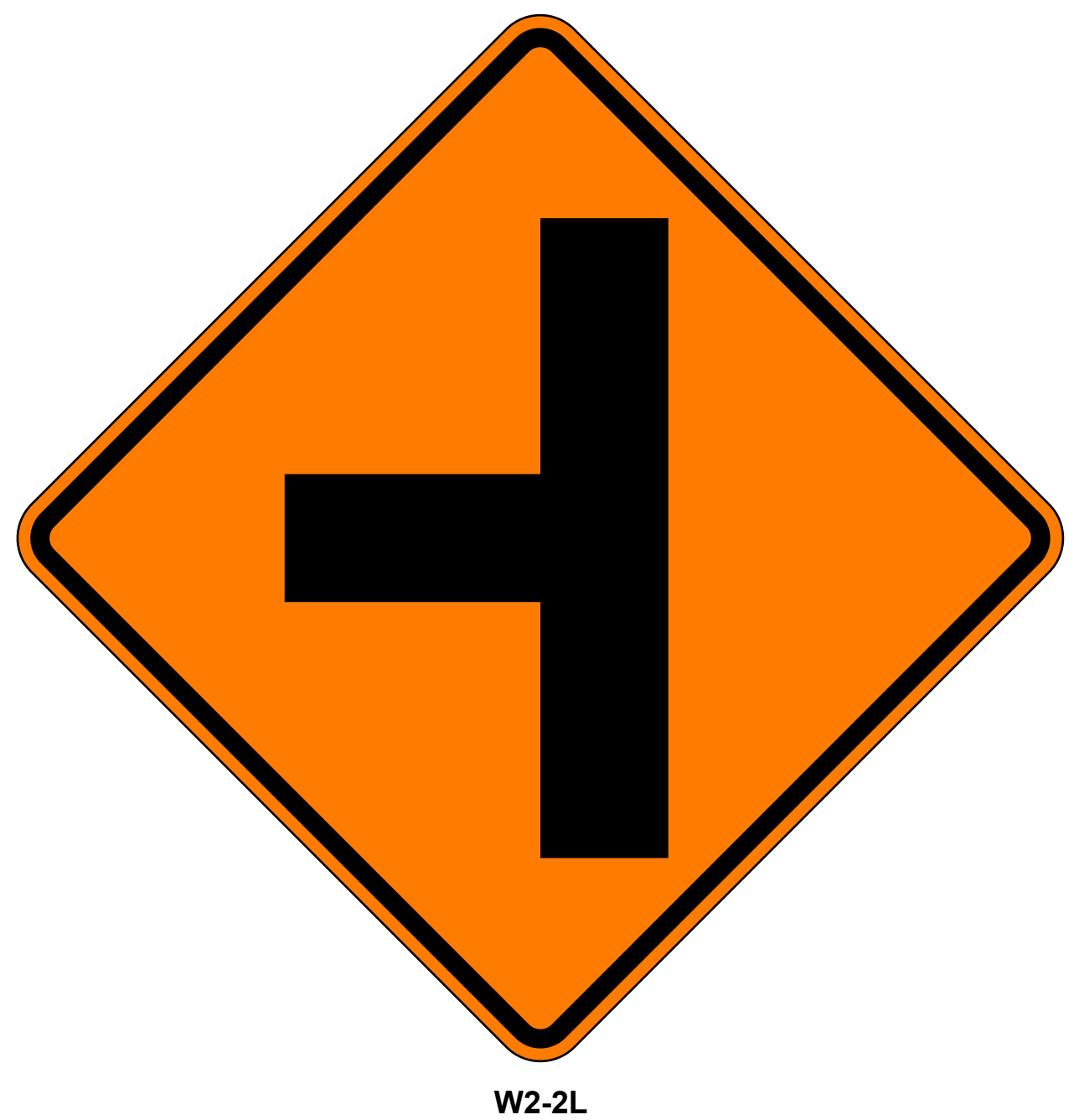
Side Road Intersection (Left)