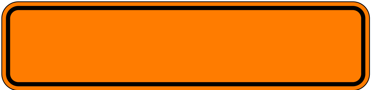
W16-8P Street Name (1 line) (plaque)