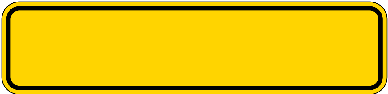
W16-8P Street Name (1 line) (plaque)