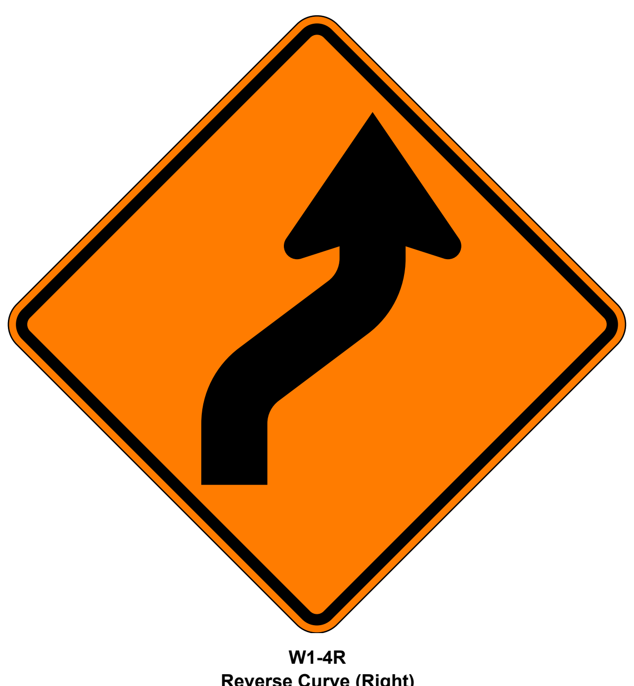
Reverse Curve (Right)