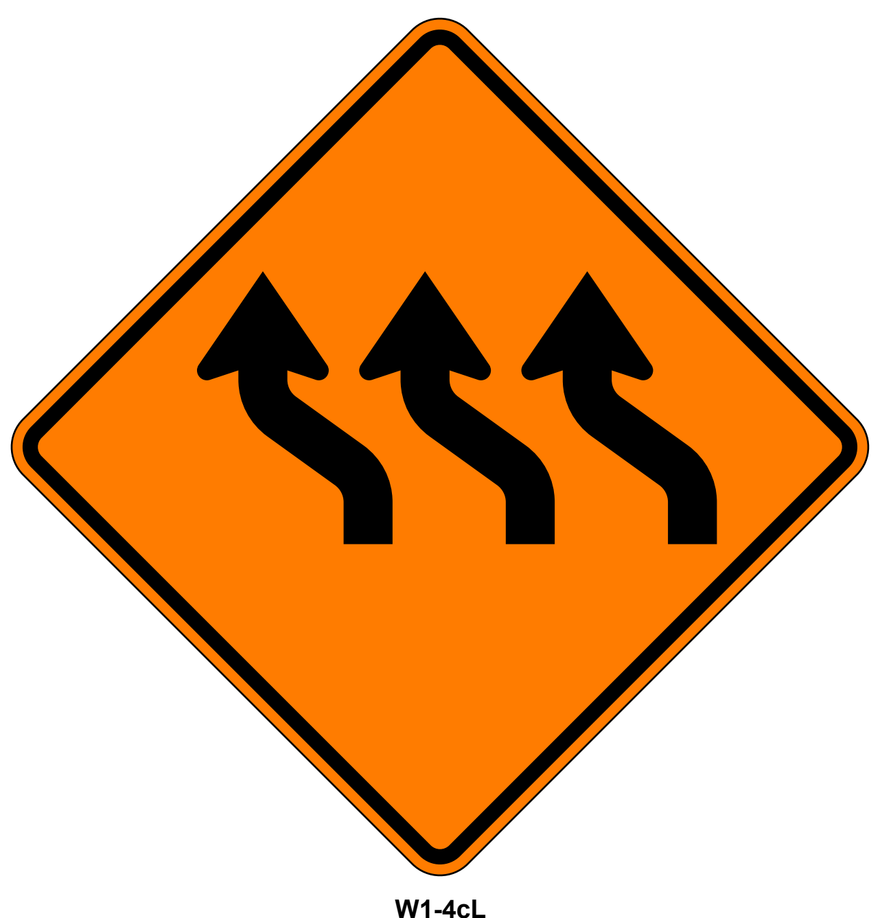
W1-4cL Reverse Curve (3 Lanes) (Left)