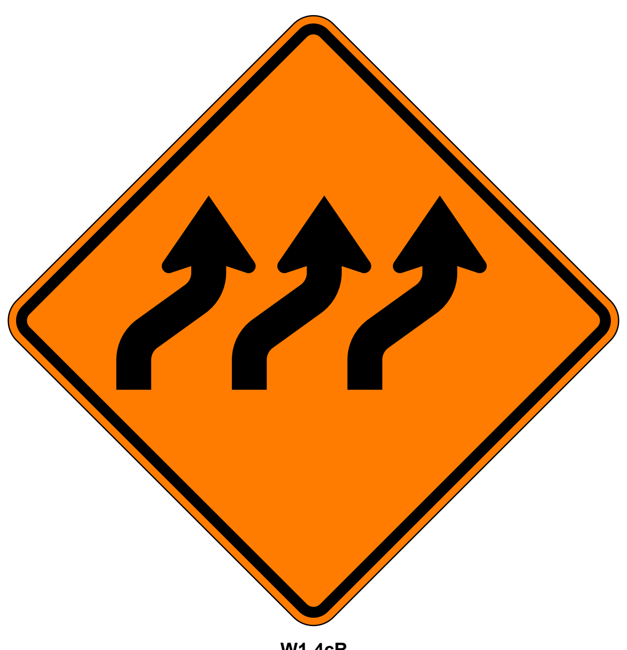
W1-4cR Reverse Curve (3 Lanes) (Right)