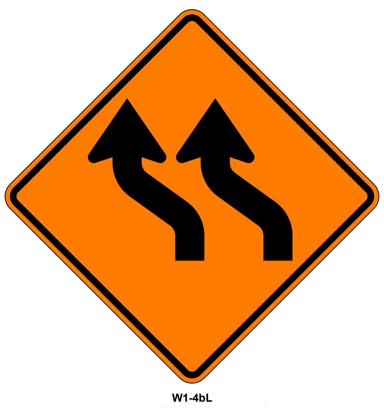
Reverse Curve (2 Lanes) (Left)