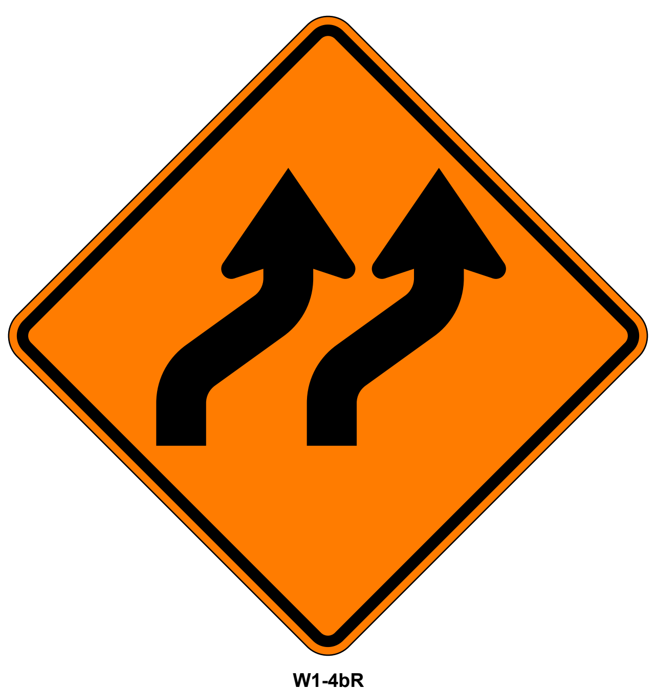
W1-4bR Reverse Curve (2 Lanes) (Right)