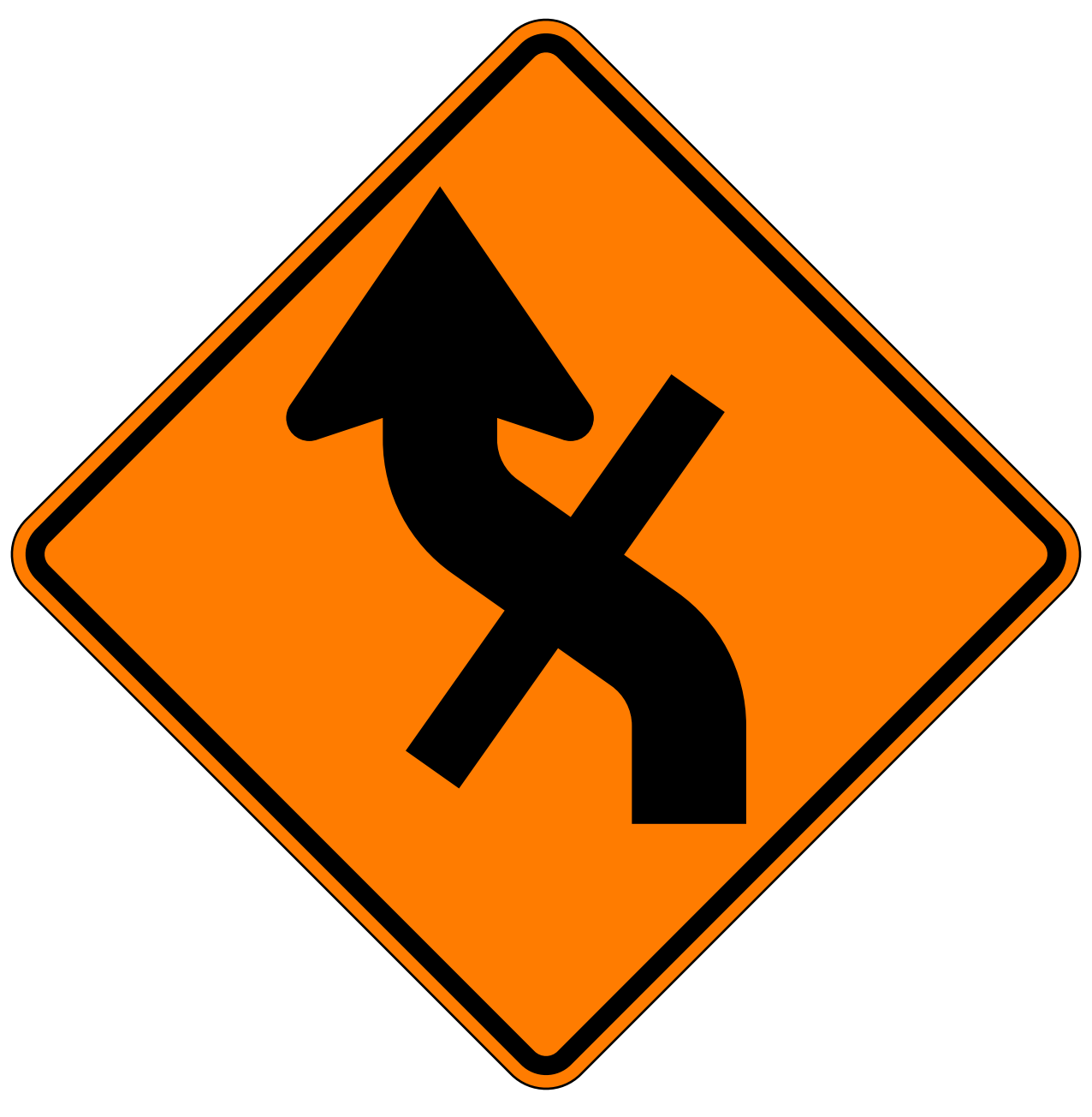
W1-10eL Combination Reverse Curve / Cross Road Intersection (Left)