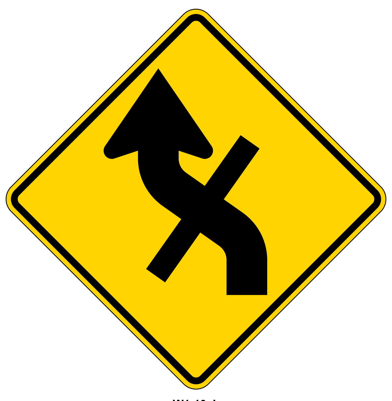
W1-10eL Combination Reverse Curve / Cross Road Intersection (Left)