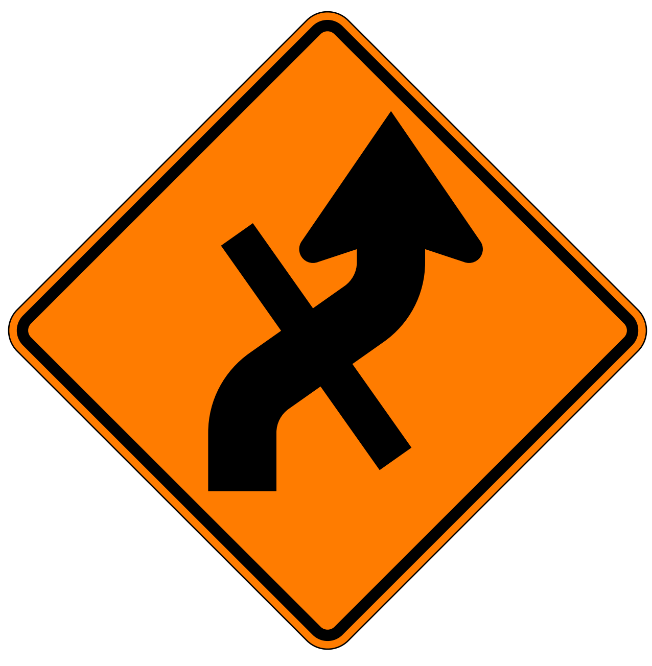
W1-10eR Combination Reverse Curve / Cross Road Intersection (Right)