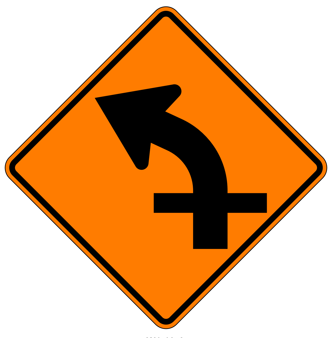
W1-10aL Combination Curve / Cross Road Intersection (Left)