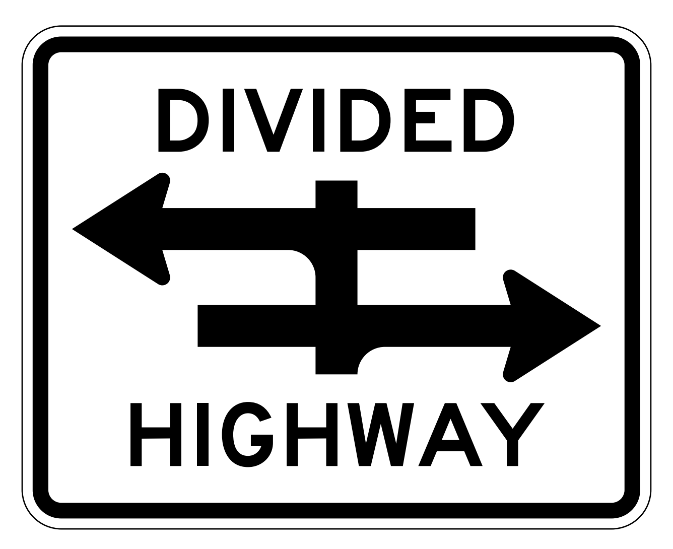
R6-3 Divided Highway Crossing