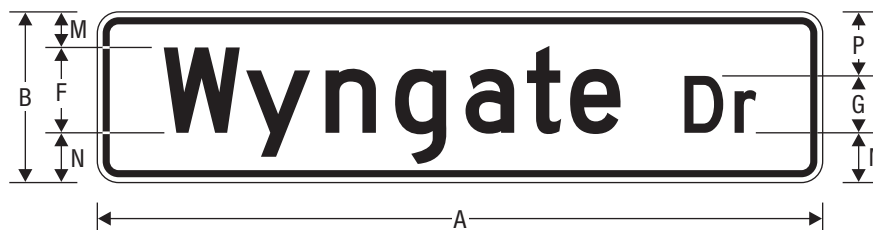
D3-1 – PRINCIPAL LEGEND WITH DESCENDING STROKES (ALTERNATE COLOR ARRANGEMENT)