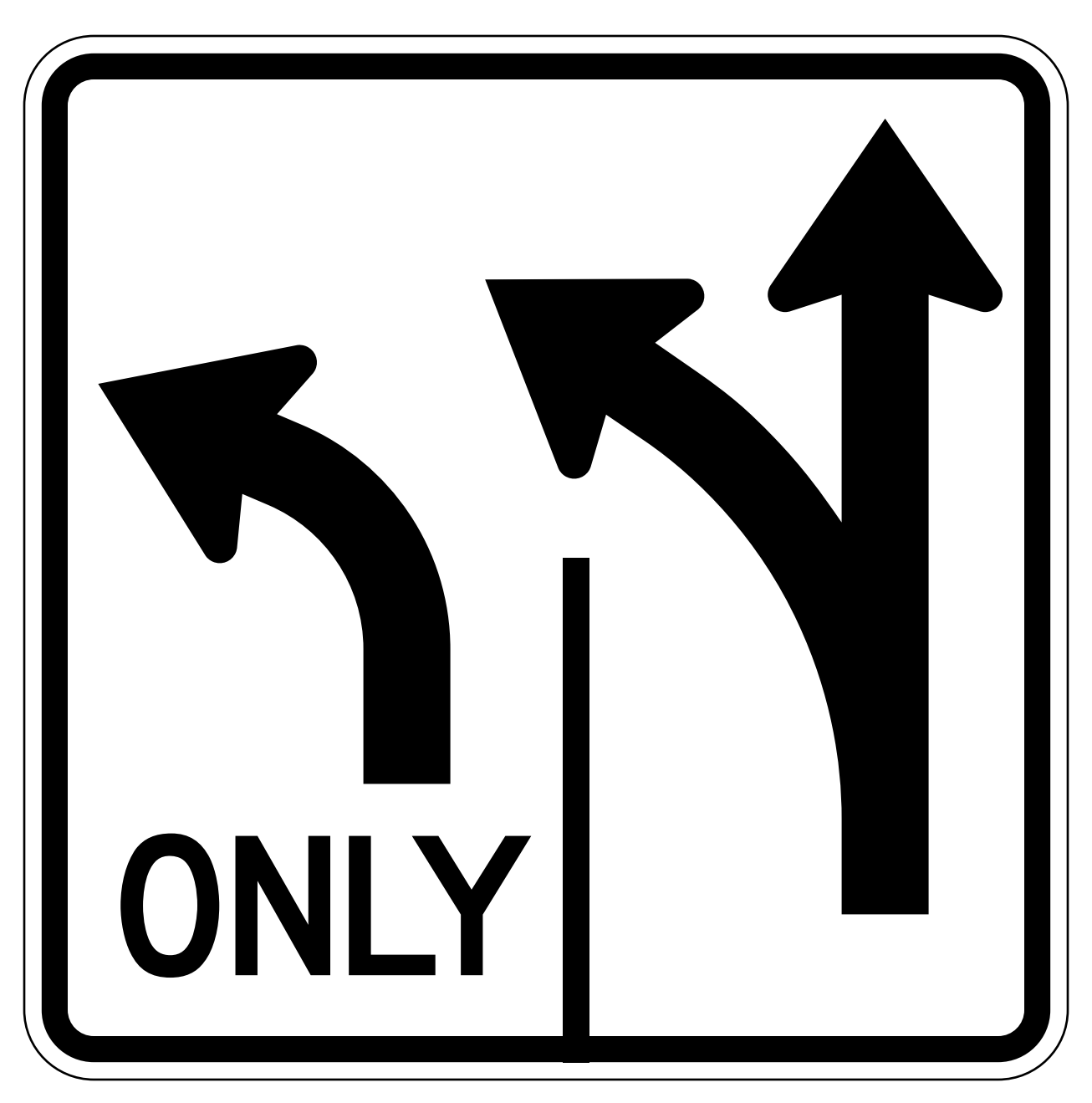
R3-8 Intersection Lane Control (2 lane)