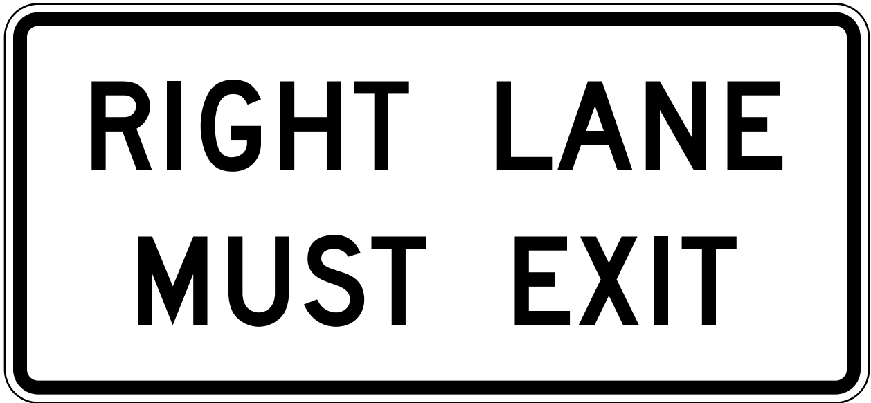
R3-33 Right Lane Must Exit